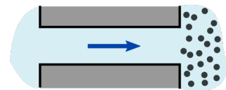
(a) Osmosis in a semi-permeable situation (the nanopore fully excludes the solute but lets the solvent flow)

Extension into a PhD study is possible, with a variety of options depending on the focus and taste (e.g. experimental vs. modeling) of the candidate.